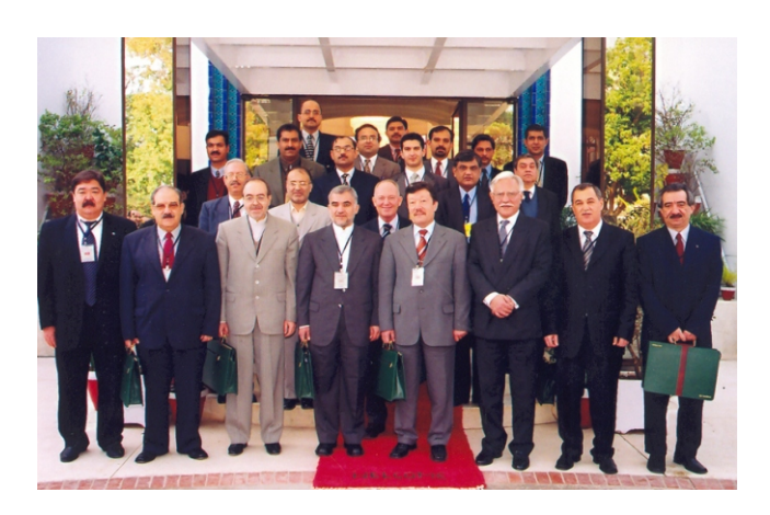
Group photograph of ECOSAI delegates on the occasion of 9th Governing Board Meeting at Islamabad on January 26, 2004