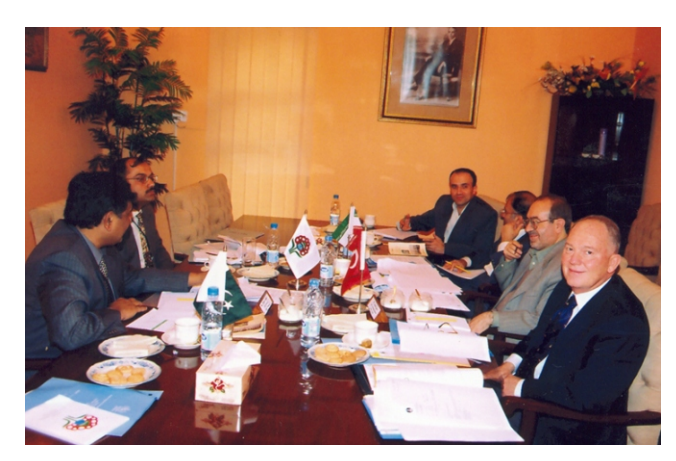
Participant discussing a point during the 4th ECOSAI Training Committee Meeting at Islamabad on January 26, 2004